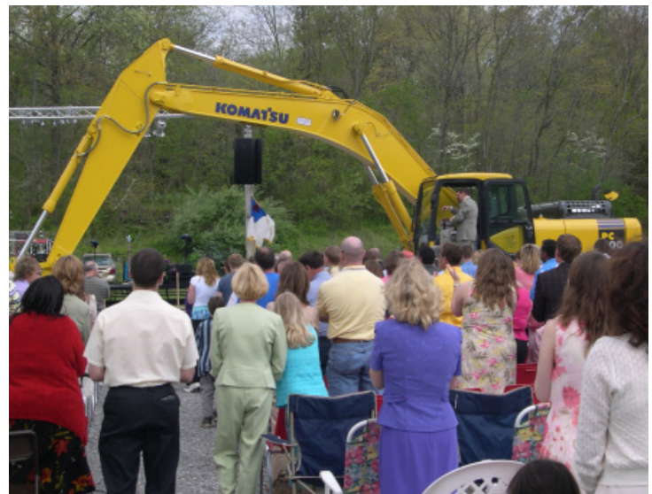
Ground breaking on Easter Sunday.

The new expansion will accommodate a continually growing church, and provide